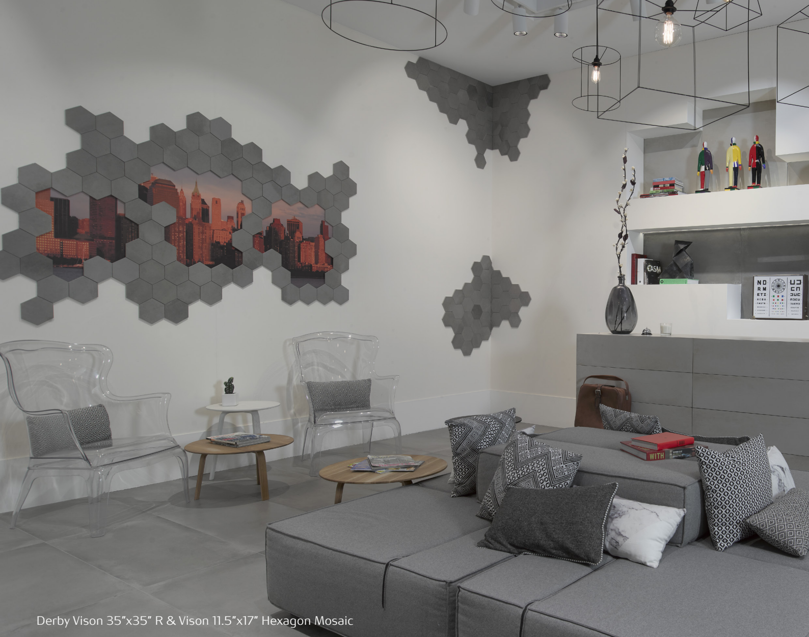
Derby Vison 35"x35" R & Vison 11.5"x17" Hexagon Mosaic