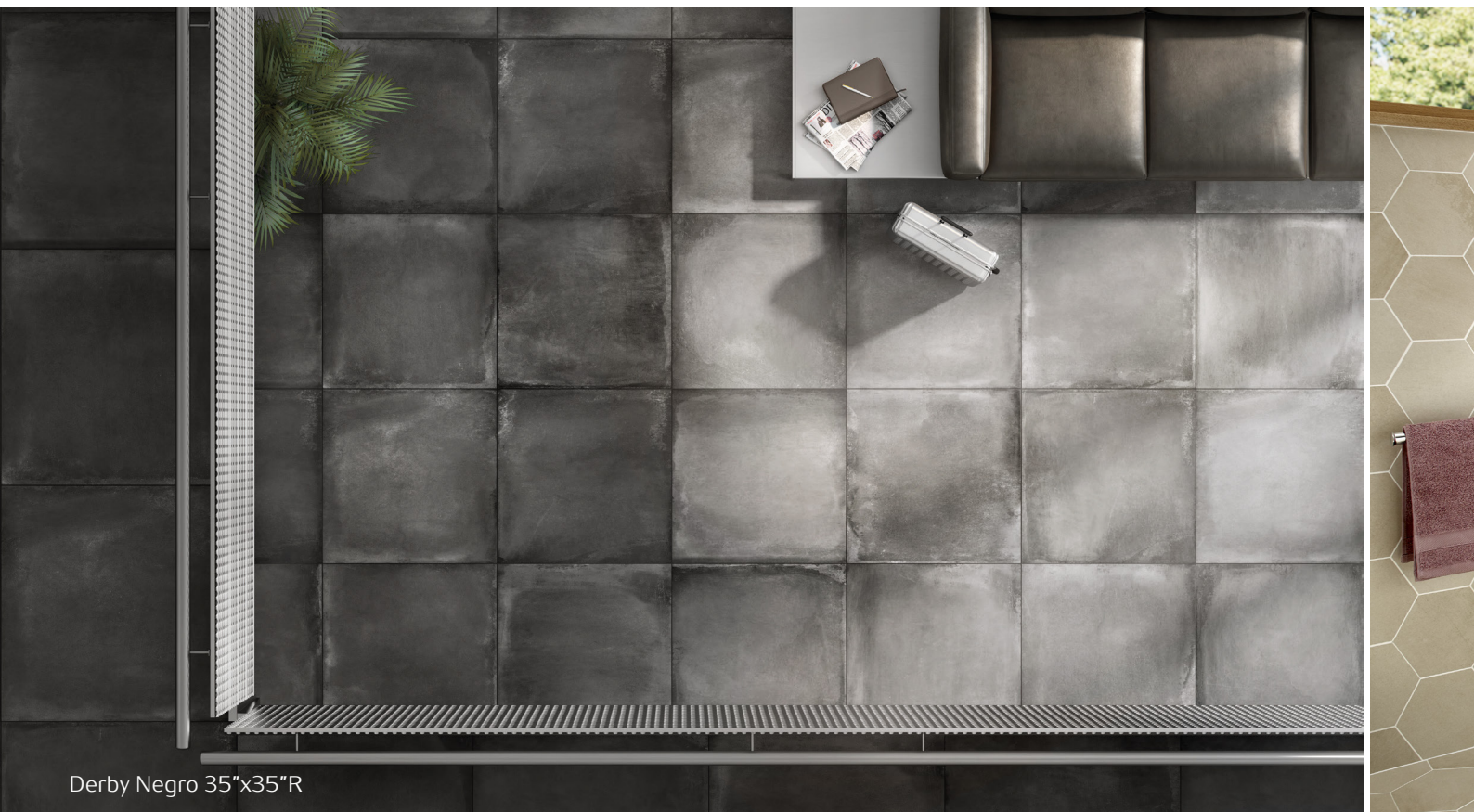
Derby Negro 35"x35"R