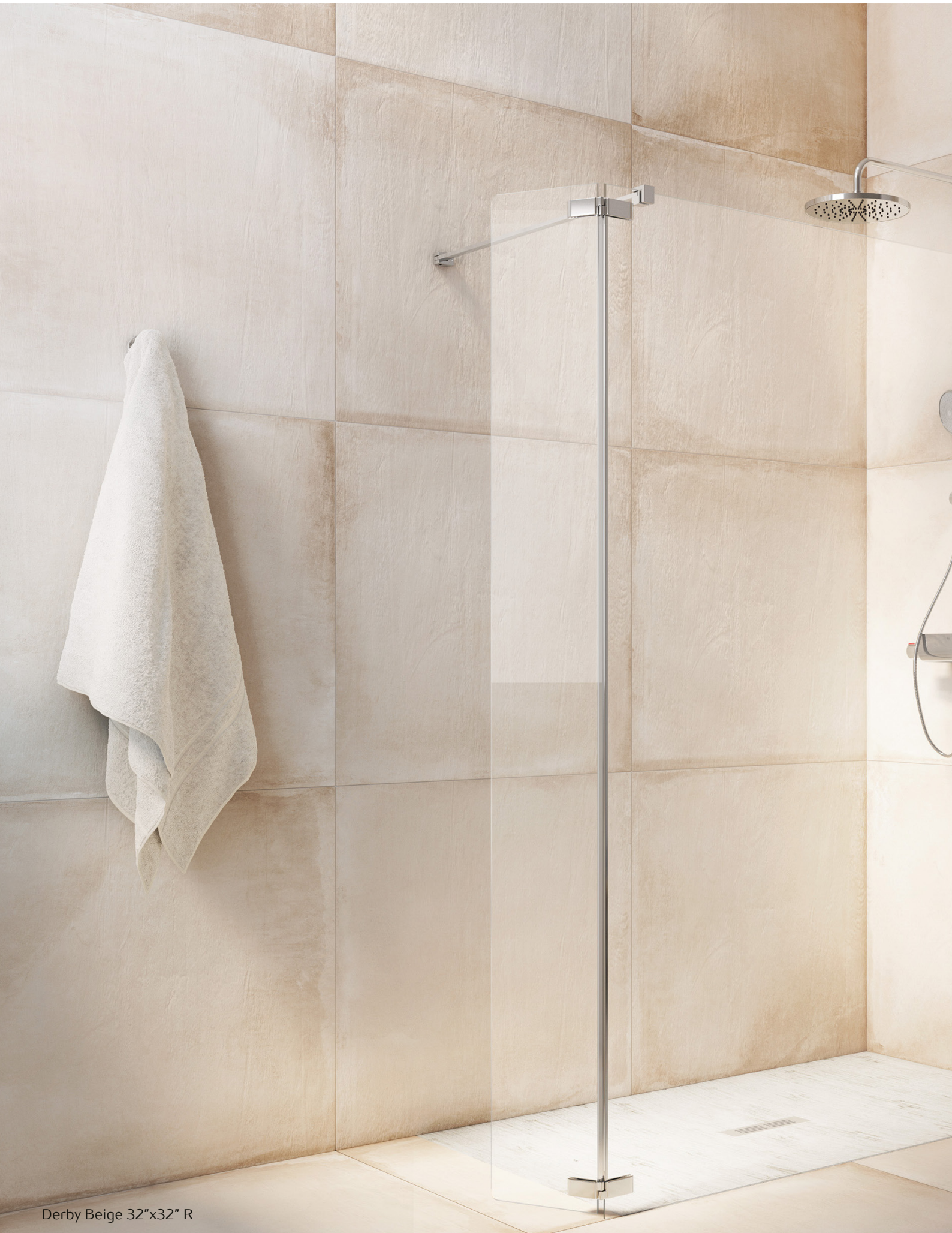
Derby Beige 32"x32" R