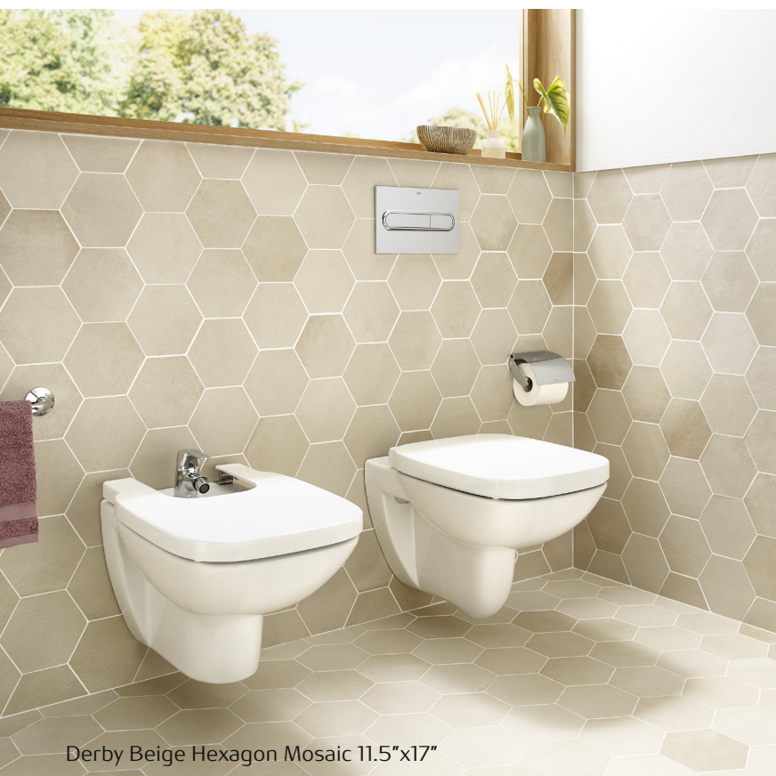
Derby Beige Hexagon Mosaic 11.5"x17"